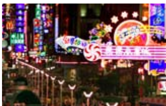
Shoppers crowd under colourful neon lights along Shanghai's bustling Nanjing Road

Some key facts and figures about China's population.